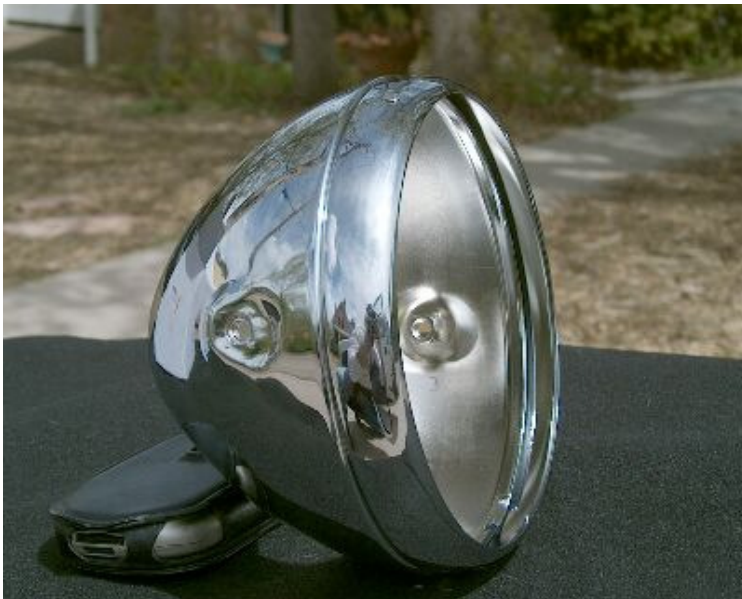
Empty Bucket with Trim Ring

A picture, being worth exactly 1000 words, we present you, fair customer, the following 4000 word dissertation.